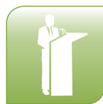
Seminars & Events