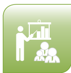
Training & Development