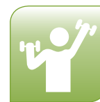
Sports & Leisure Club