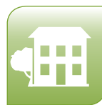
Accommodation on Campus